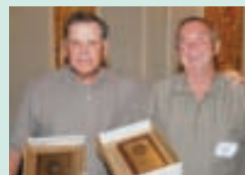
L.U. Retirees—page 7