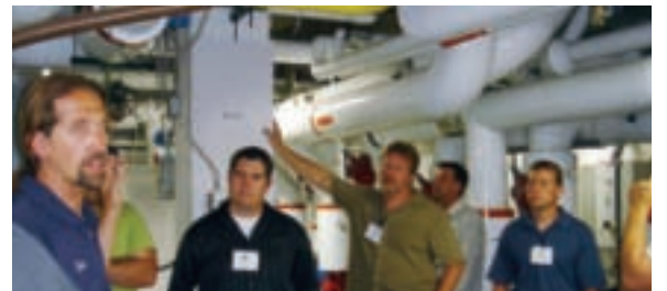
Members get a "Behind-the-Scenes" look at the Shedd.

The PCA was fortunate enough to visit the Shedd Aquarium before its major upcoming renovation. We look forward to coming back for another visit after the work is completed.