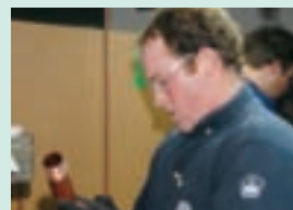
Apprentice Contest—page 10