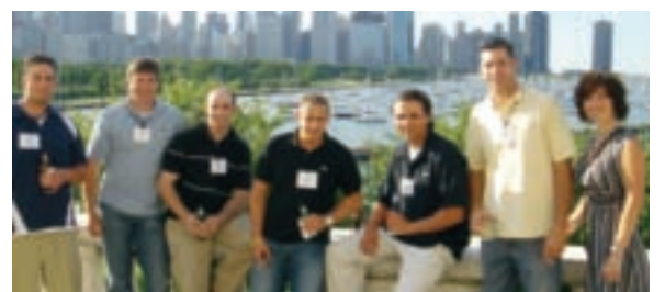
Everyone enjoyed the scenic view during the cocktail hour at the Shedd's Soundings Restaurant.