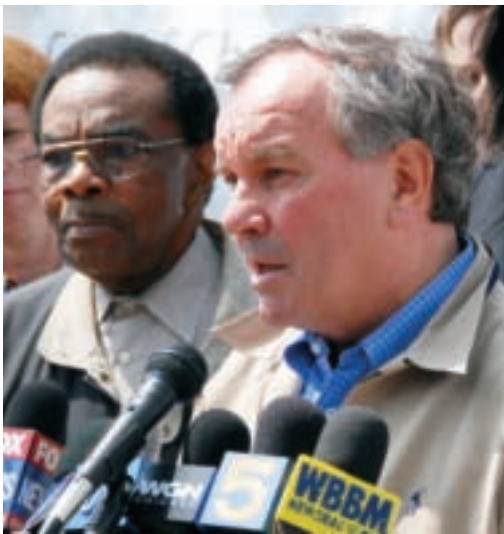
Chicago Mayor Richard M. Daley addresses the morning press conference.